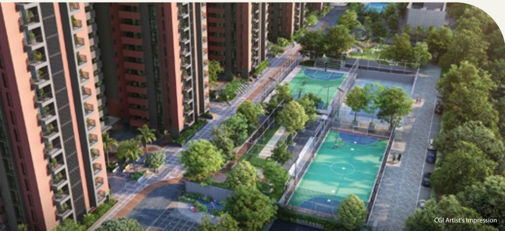
CGI Artist's Impression