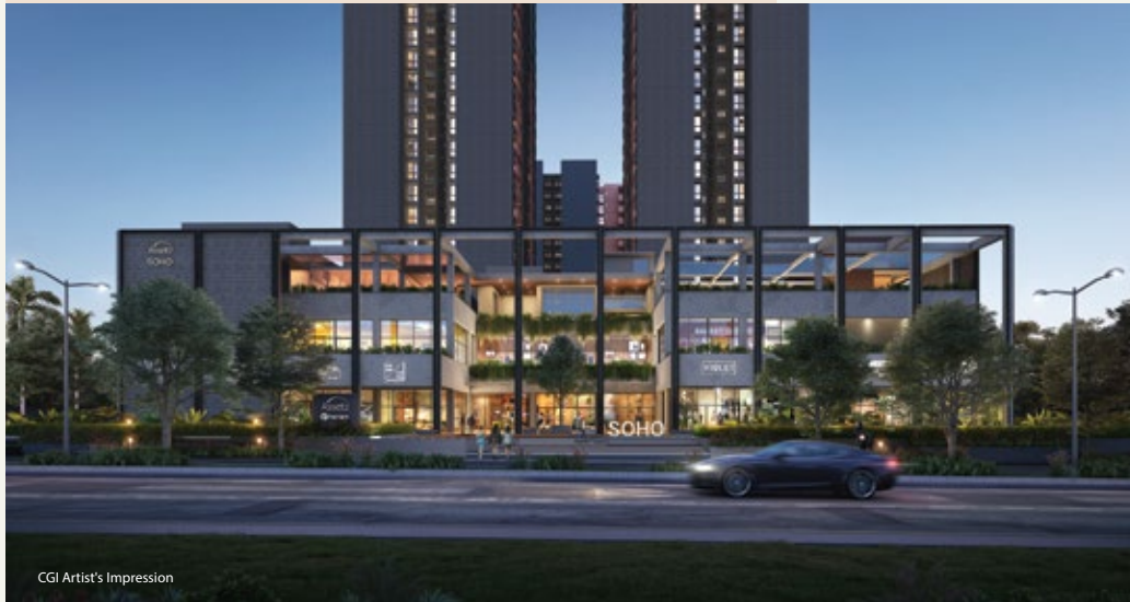
CGI Artist's Impression